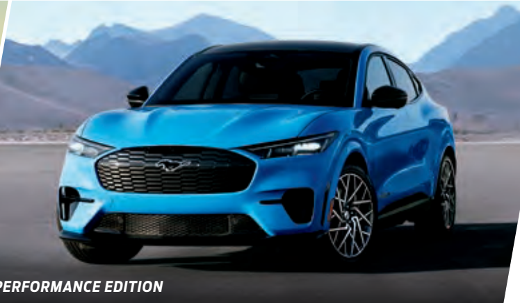
GT PERFORMANCE EDITION