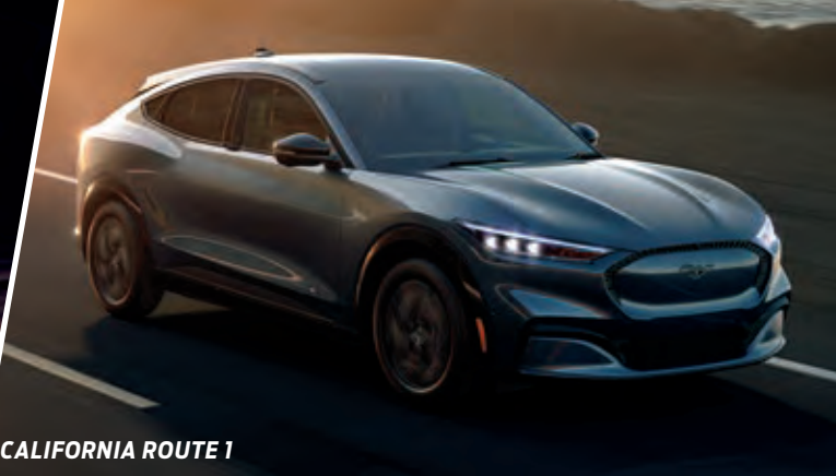
CALIFORNIA ROUTE 1