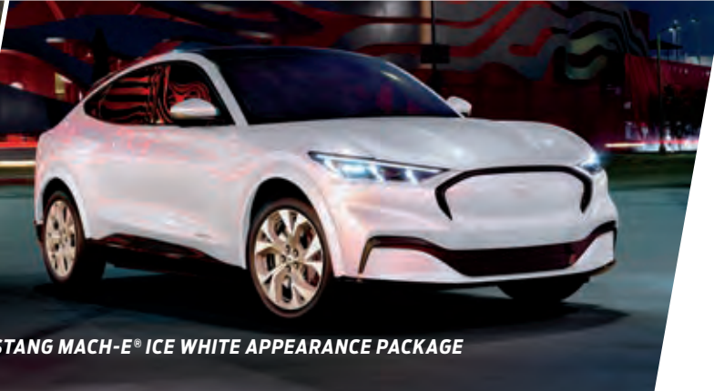
MUSTANG MACH-E® ICE WHITE APPEARANCE PACKAGE